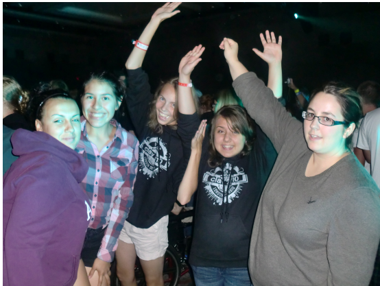
Some of our youth in the mosh pit...

The youth had a FANTASTIC time at "Hand's On" and are looking forward to sharing their experiences with the congregation at a future date. Thank you to everyone who helped us get there! "Lift up your strawberry to the Lord!"